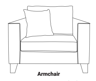
H:100 x W:92 x D:92 (cm) x1 Small Accent Scatter