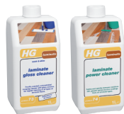
HG P73 HG P74