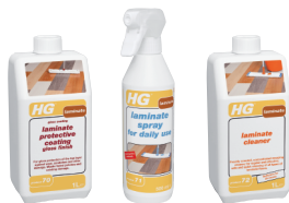
HG P70 HG P71 HG P72